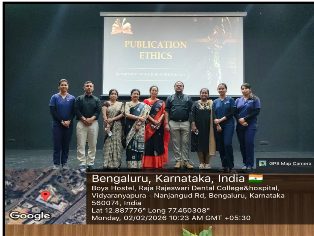
FACULTIES AND POSTGRADUATES OF DEPARTMENT OF PUBLIC HEALTH DENTISTRY