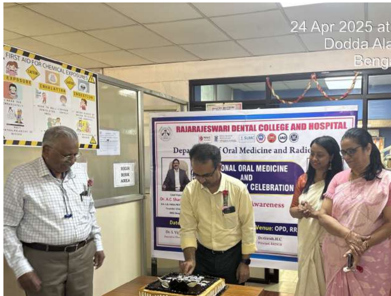
Cake cutting celebration on National Oral Medicine & Radiology Day