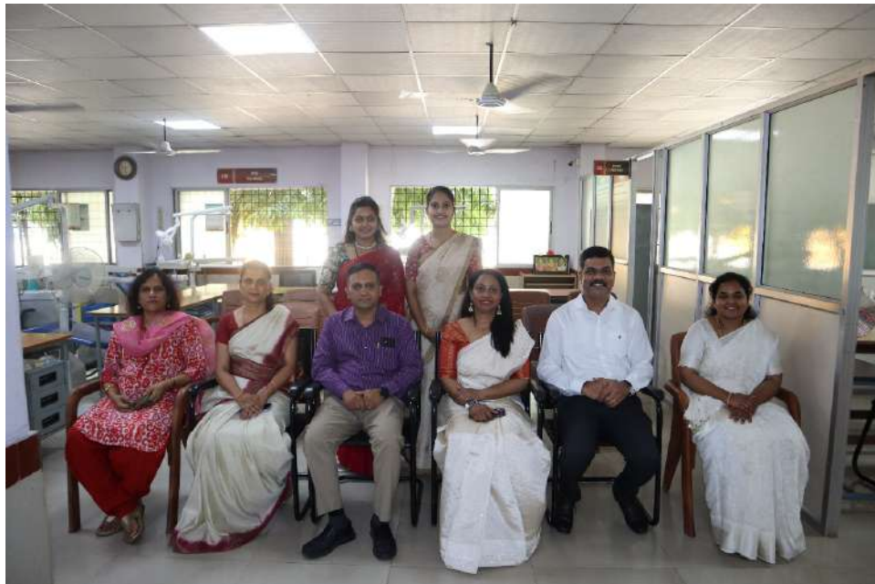
Faculty and Post Graduates of Department of Oral Medicine & Radiology