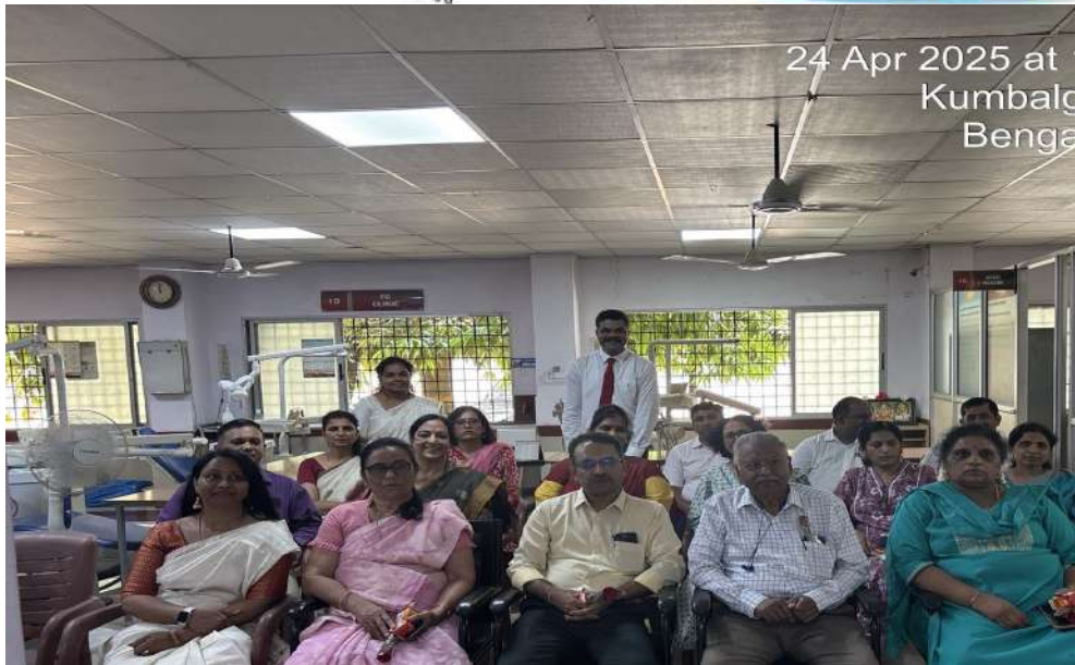
Dean, Principal, faculty & HoD's of all department