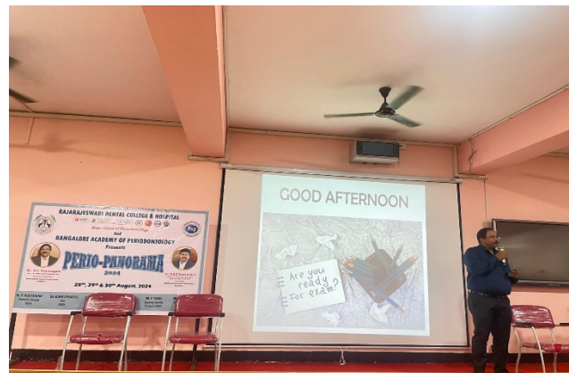
PHOTOGRAPHS OF THE PROGRAMME