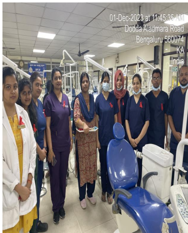
DISTRIBUTION OF RED RIBBION TO ALL THE FACULTY OF RRDCH