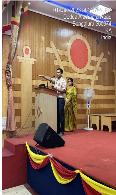
OATH TAKING CEREMONY