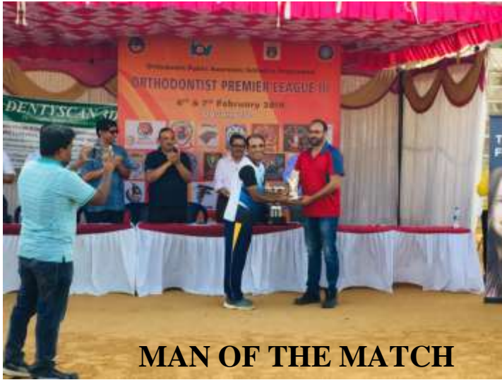
MAN OF THE MATCH