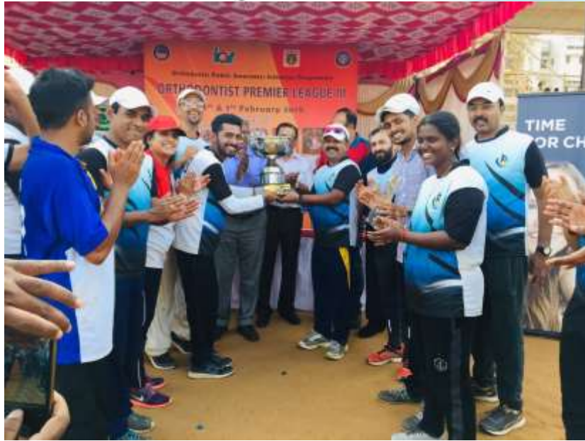
MOST VALUABLE PLAYER OF THE TOURNAMENT