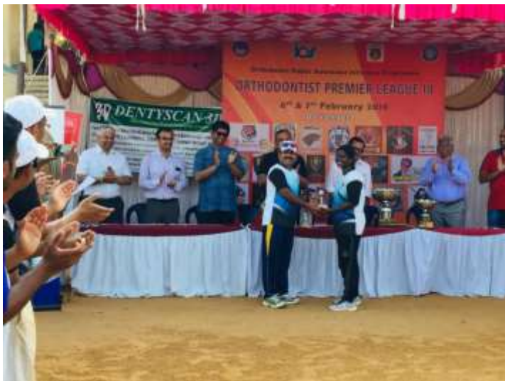
BEST FEMALE PLAYER