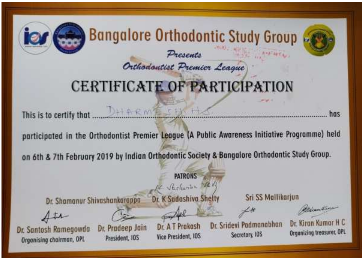
CERTIFICATE OF ALL INDIA ORTHODONTICS PREMIER LEAGUE -2019