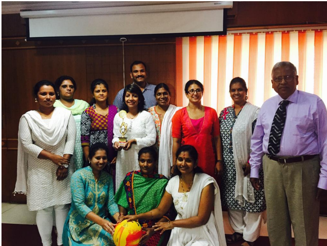
CHAIRMAN CUP THROWBALL 2017 BY RRMCH

RRDCH was declared as runner of this tournament.