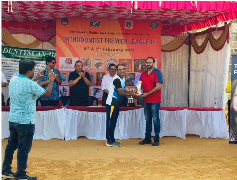
MAN OF THE MATCH