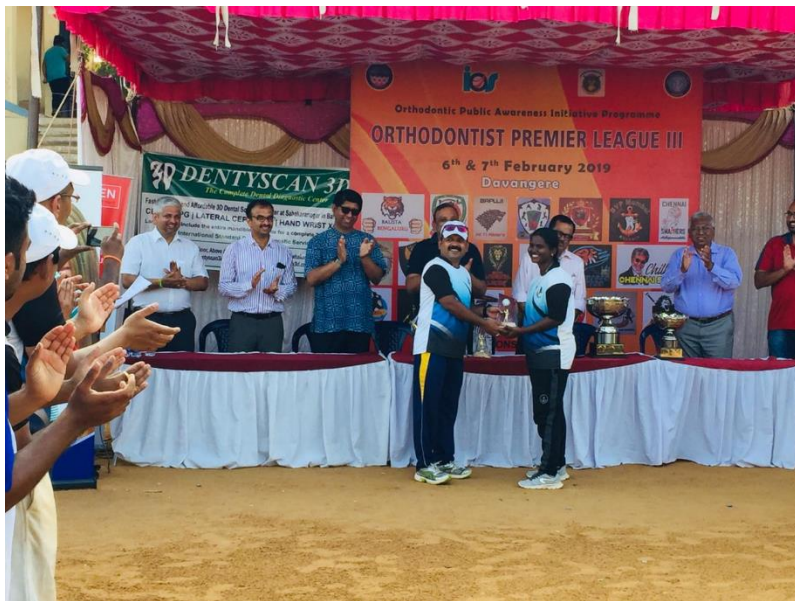
BEST FEMALE PLAYER